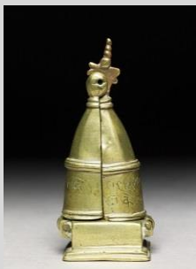
Portable shrine of the Tirthankara Parshvanatha (EAOS.109)