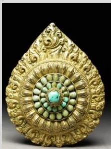
Reliquary with lotus ornament amid flames (EA2006.90)