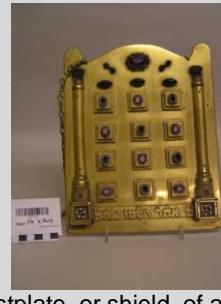
Breastplate, or shield, of a Torah (EAX.309)