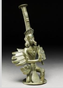
Incense holder in the form of Garuda (EAX.281)