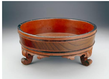
Basin used for a Buddhist hand-washing ceremony (EA2002.32)