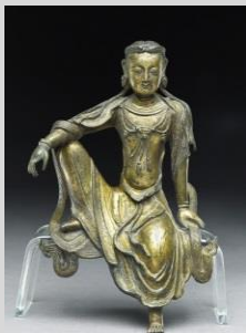
Seated figure of a bodhisattva (EA1956.1376)