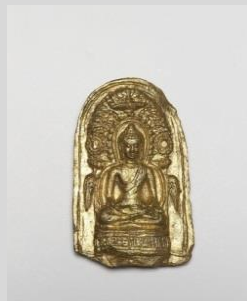
Votive plaque of the Buddha (EAX.2509)