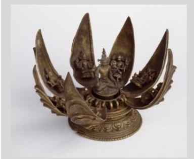
Figure of Vishnu in the lotus (EAX.285)