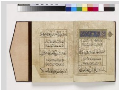
Qur'an in muhaqqaq and naskhi script (volume 11 of 30) (EA2012.86)