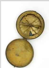
Qibla compass (EA1992.41)