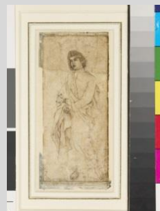
Saint John the Evangelist (EA1978.2597)