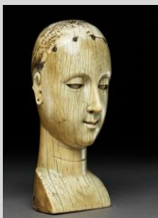
Head of the Virgin Mary (EA1963.181)