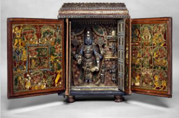
Portable shrine of Vishnu as Venkateshwara (EAX.264)